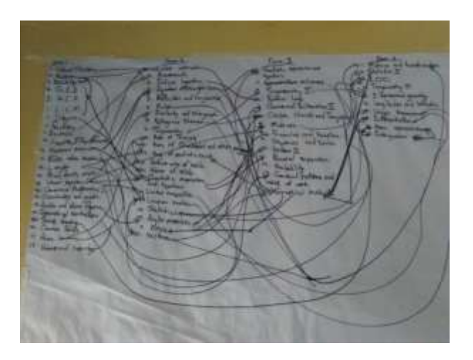
Figure 1 Group 2 Chart Showing Connections of Topics

The students connected the topics within a grade and across two or more grades while others were not connected at all. The connection chart developed by Group 2 is presented in Figure 1.